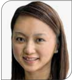
YB Hannah Yeoh Deputy Minister of Women, Family and Community Development

Hannah Yeoh is the former Speaker of the Selangor State Legislative Assembly and current Member of Parliament for Segambut. She was appointed Deputy Minister of Women, Family and Community Development in July 2018.